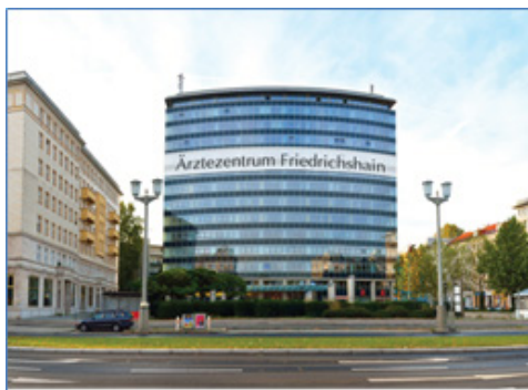
Karl-Marx-Allee 90 A 10243 Berlin-Friedrichshain

Centre for Radiotherapy www.radio-strahlentherapie.de