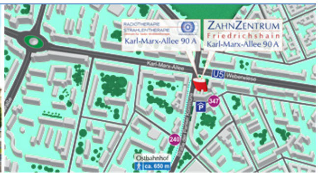
U5 U5 Weberwiese 240 Bus 240 347 Bus 347 -- ca. 650 m Ostbahnhof P Tiefgarage 80 Cent / Stunde

Book online – easy and quick with transparent prices: www.capital-health.de