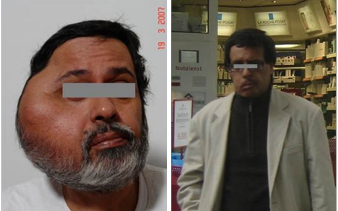
Tumour of the lower jaw before and after the surgery

Before treatment at the CAPITAL HEALTH the patient has had six previous operations. This patient as well was rejected for further treatment at four university hospitals in England and Germany. A hospital in Germany was willing to perform the operation, but with the removal of the right eye.