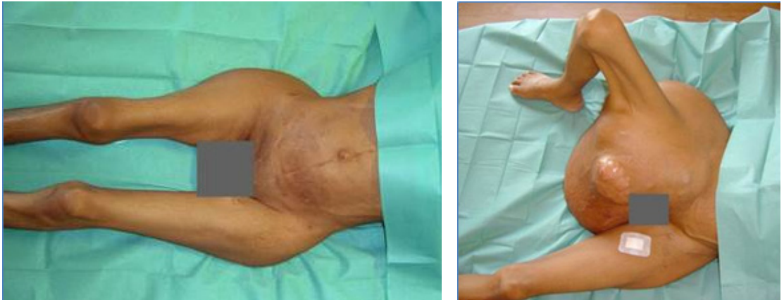
Tumour of the pelvis before and after the surgery

The patient had four previous operations. Before treatment at CAPITAL HEALTH, she was rejected at six renowned university hospitals for further treatment (2 x in the US, 1 x in France, 1 x in England, 1 x in Holland, and 1 x in Germany).