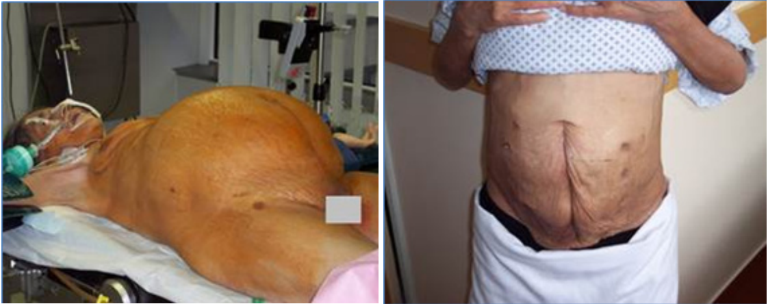
Peritoneal tumour before and after the surgery

This 56-year-old patient was operated previously four times and also was rejected for further treatment at two university hospitals in Saudi Arabia and England. Our highly qualified specialists have been able to remove the tumour and to considerably improve the life quality of the patient.